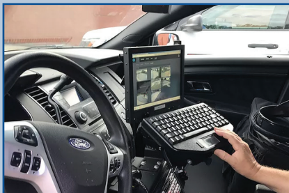
A police officer accesses Upper St. Clair's security platform from his patrol car.

Security incidences on school property are swiftly resolved, keeping children, faculty and visitors safe.